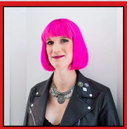
Charlie Jane Anders

Award-Winning Author & Poet "The Rat King" "Melancholia"