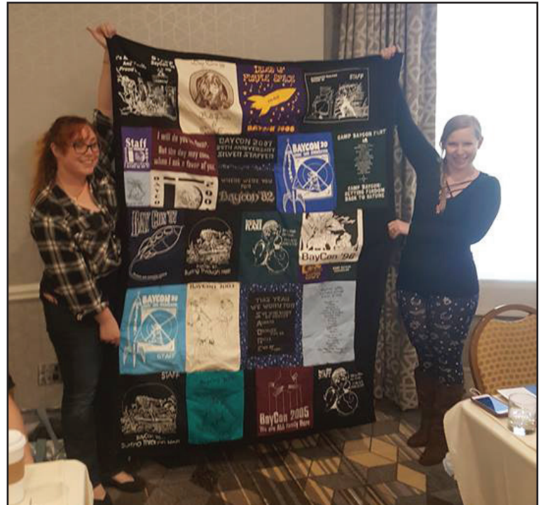
A quilt and a couple of co-chairs

Head over to Connect 3 at 10:00 AM tomorrow to support the Juvenile Diabetes Research Foundation!