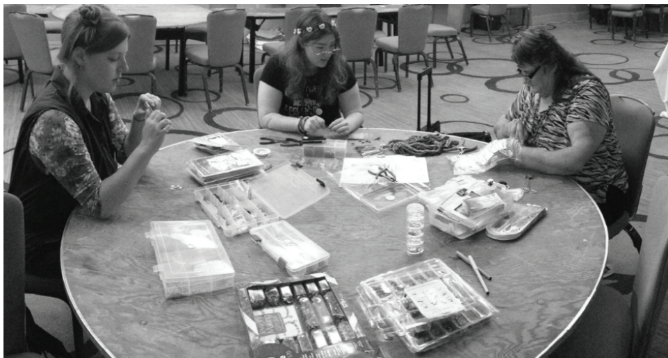
Fun and Crafting in the DIY Room