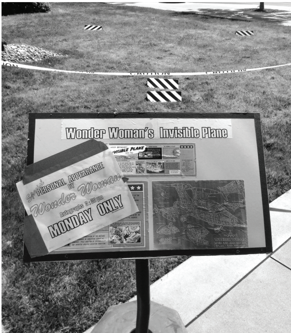
Wonder Woman's Invisible Plane — In case you didn't see it.